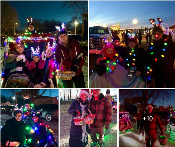
Donuts make trishaw bike rides even sweeter. 🍩

We had SO MUCH fun at the Lights on Broadway parade. Decking the bikes out in lights and cruising down Broadway brought us so much joy.